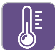
Comfortable temperate seating experience