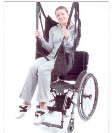
Titanium 'TiLite' chair courtesy of Gerald Simmonds Healthcare 01296 380200.

Similarly designed to the SAS Para but not limited to use with moulded chairs. The InChair Glove is suitable for general use where users remain seated on the sling for longer periods. Very soft and comfortable with excellent air permeability to help in reducing sweating. Pressure maps, resulting from independent testing, provide powerful evidence to illustrate the benefits of this revolutionary new sling. Also fitted with “Pocket Strap” system to keep sling more discreet and avoid straps tangling with wheels, brakes, etc. Suitable for wide range of sizes up to 350kg (55 stone).