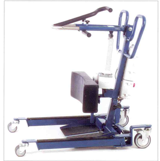
Model Ref: 2400